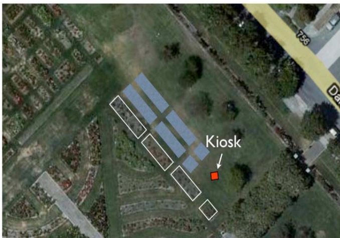
All-America Rose Selection Test Bed Layout

So where does the class of 2010 go? New beds will be dug next to the existing AARS Test Beds. Below is a plan, with the new beds marked in blue. The area marked “Kiosk” is the proposed location of a future addition – an Interpretative Panel ( fancy name for sign ) which will feature information on the AARS Test Beds. The goal is to have the AARS Test Bed area set up in a clearly defined