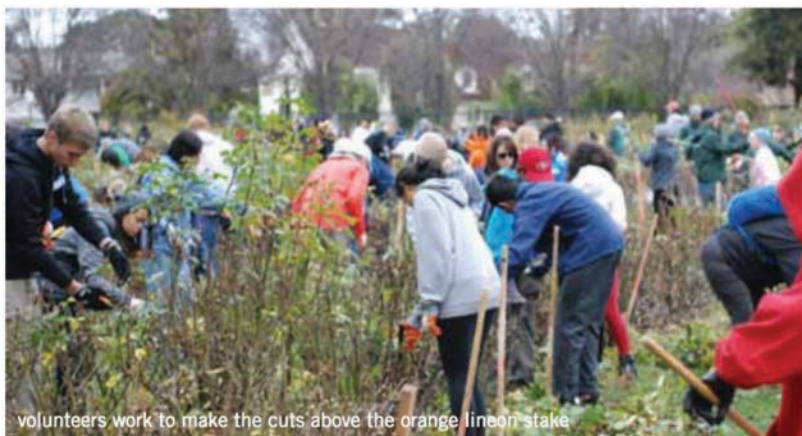
volunteers work to make the cuts above the orange line on stake

Visitors always thank us for the opportunity to visit and I thank them for coming, because all the work that goes into the garden is too much for just us to enjoy. Think about sharing your beautiful garden with others, you won't be disappointed!