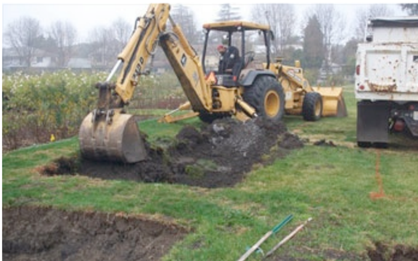
A backhoe digs out one of the 6 new beds that will house the new AARS Test Roses

San Jose is honored to be one of 24 All-America Test Selection (AARS) Test Gardens in the United States. We grow test varieties that go through a vigorous judging process in the hope of becoming an AARS Winner. The new 2010 AARS Test Beds are now complete, and planted. 36 new varieties are on competition to become the 2014 AARS winner. There are 7 Hybrid Teas, 10 Floribundas, 6 Grandifloras, and 8 Landscape Roses and 1 Climber. We have no idea what these roses