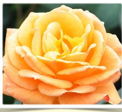
Good as Gold